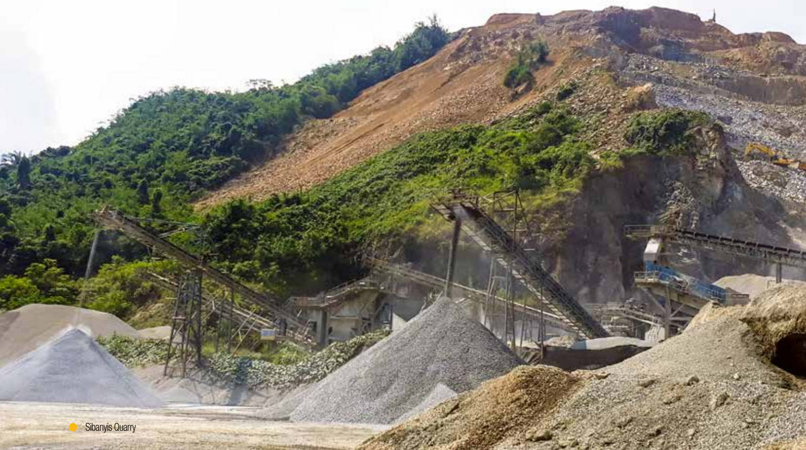
● Sibanyis Quarry