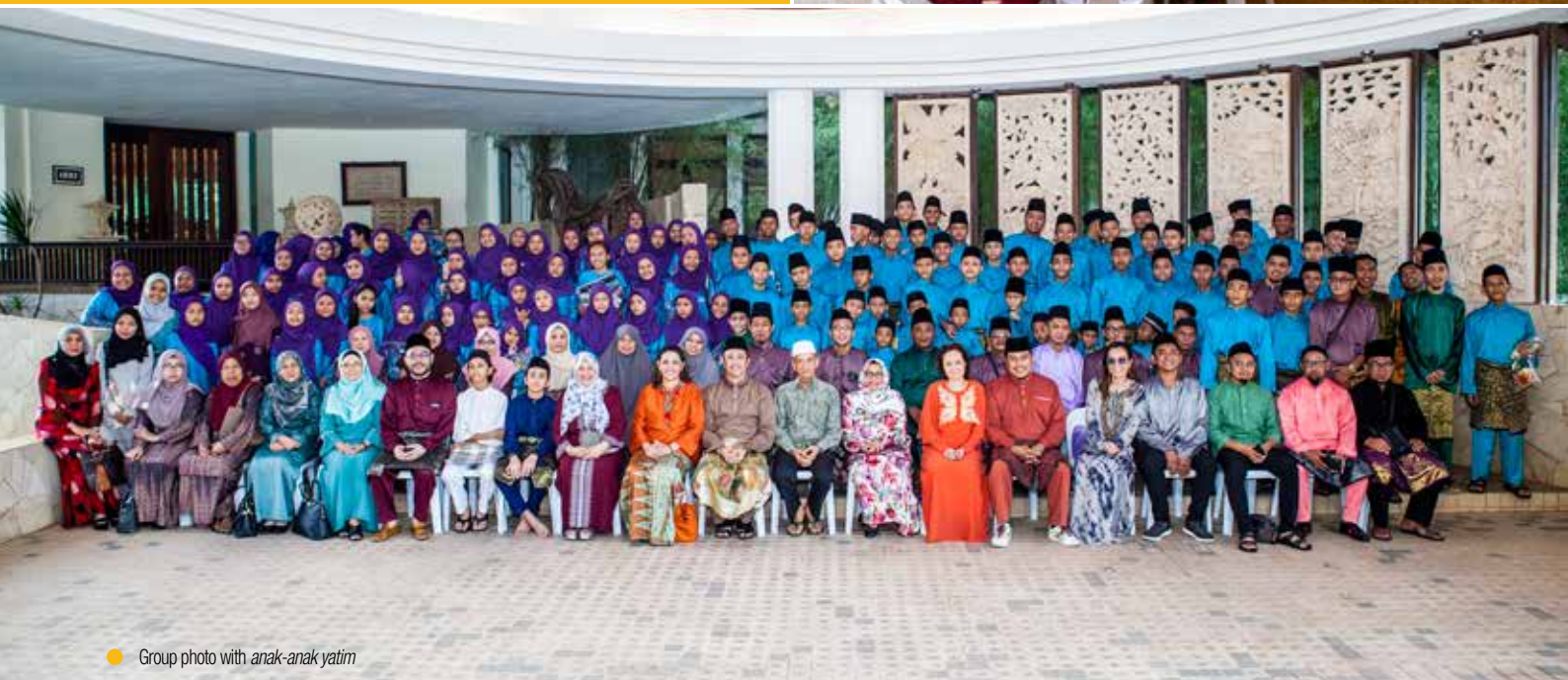
● Group photo with anak-anak yatim