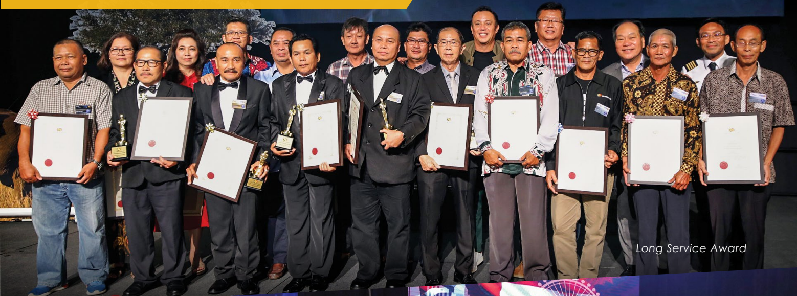
Long Service Award