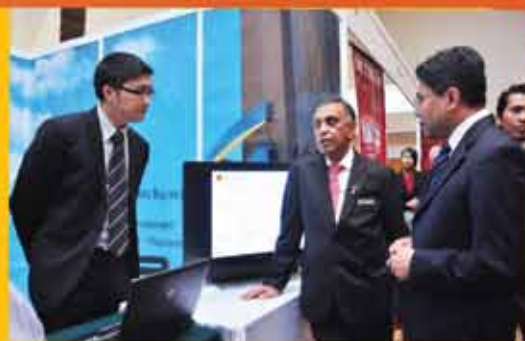
Y.B. Tan Sri Nor Mohamed Yakcop visiting CMS Opus' booth