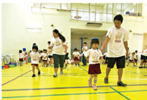
Egg and Spoon race