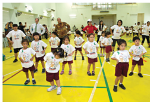
Mass Aerobics participation