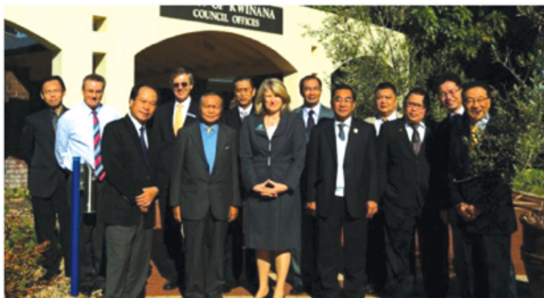
Group photo with Mayor of Town of Kwinana

The entourage met the Mayor and CEO of the local council of the Town of Kwinana and the Director of a non-profit business association, Kwinana Industries Council (KIC). Briefings were provided to share their invaluable knowledge and experiences in planning and developing Kwinana including the lessons learned.