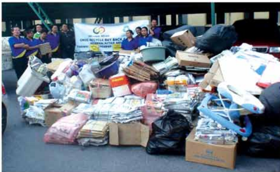
Some of the committee members with the collected recyclable waste

This campaign managed to collect a total of 4,896 kg of recyclable waste in just 3 hours! The participants hope that this effort will go a long way in doing their part for a greener future!