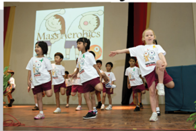
K3 Children leading the mass aerobics

Fun learning is an effective and important means of teaching children in kindergartens.