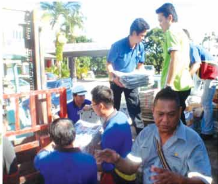
Recyclable waste weighing session in progress

A record number of 173 employees participated in the second recycling campaign by CMS Clinker Sdn Bhd. This campaign was one of the many environmental projects being held in line with the planned ISO 14001 certification of CMS Clinker Sdn Bhd.